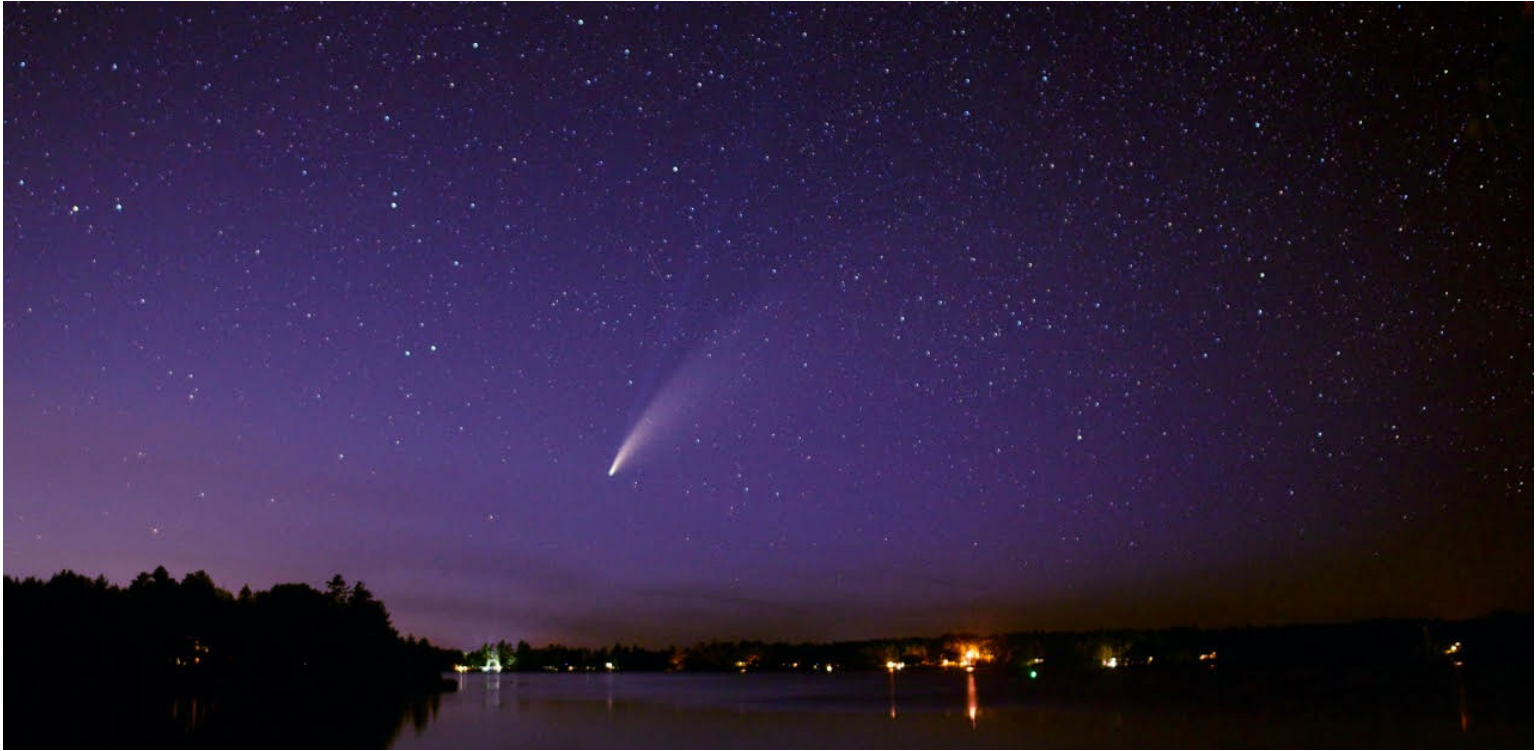
Neowise Comet over Georges Pond