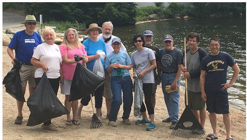
GPA members gather for beach cleanup.