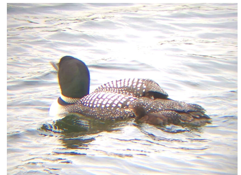
Loon with two chicks, one tucked under its wing.